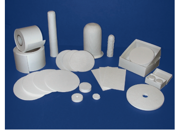
Filters – glass microfiber, cellulose, and membranes

Also available is a full line of high-quality, competitively priced sample preparation products for your QA/QC Laboratory.